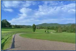
6+ ACRES WITH FRONTAGE ON THE GOLDBROOK RIVER AND LARGE POND