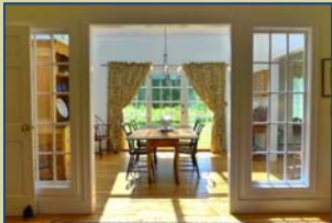
SUNNY COUNTRY-HOUSE OFFERS 1 FLOOR LIVING WITH MASTER ON MAIN