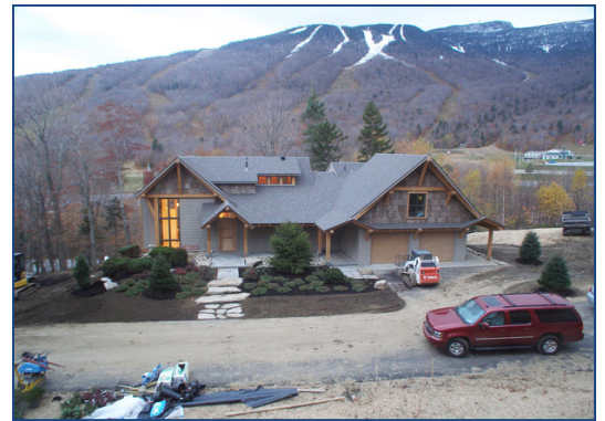
First snow 2010

HGTV will celebrate 15 years of making dreams come true when it awards the 2011 HGTV Dream Home, a new, fully-furnished modern rustic mountain home in Stowe, Vermont, early next year. The 15th annual HGTV Dream Home will be located at Spruce Peak in Vermont's Stowe Mountain Resort amid emerald-green rolling hills, winding roads, and exhilarating ski slopes. Information about the eagerly anticipated location of the home is available at Dream Home central on www.HGTV.com/dreamhome