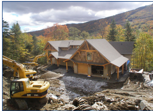
Early fall 2010

Some lucky family will be the recipient of a high quality home in a gorgeous setting just a few steps from the slopes. See article below published on the HGTV web site.