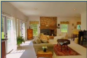
4,600+ SQ. FT WITH 4 BED- ROOMS, 2 WOOD- BURNING FIREPLACES, FAMILY ROOM & FORMAL