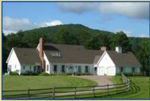
95 CHANDLER FARM STOWE, VERMONT $998,000