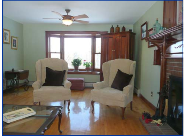
Large, sunny living room with wood floors and wood-burning fireplace.