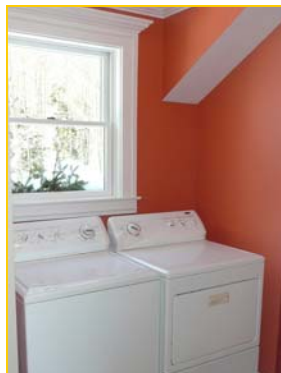
Laundry located in Master Suite