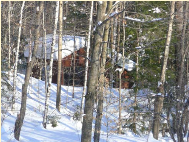
Play cabin with bunk and heater