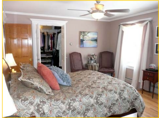
Master Bedroom has two large closets, wood floors and a sewing table and cupboards.