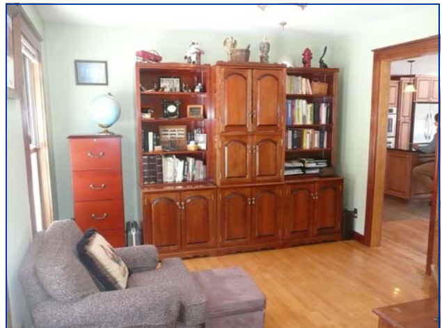
Main floor office or den and also powder room