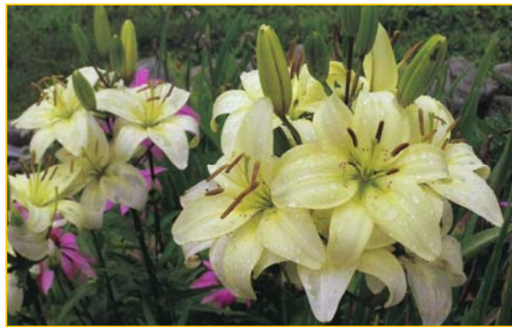
Gorgeous flower gardens